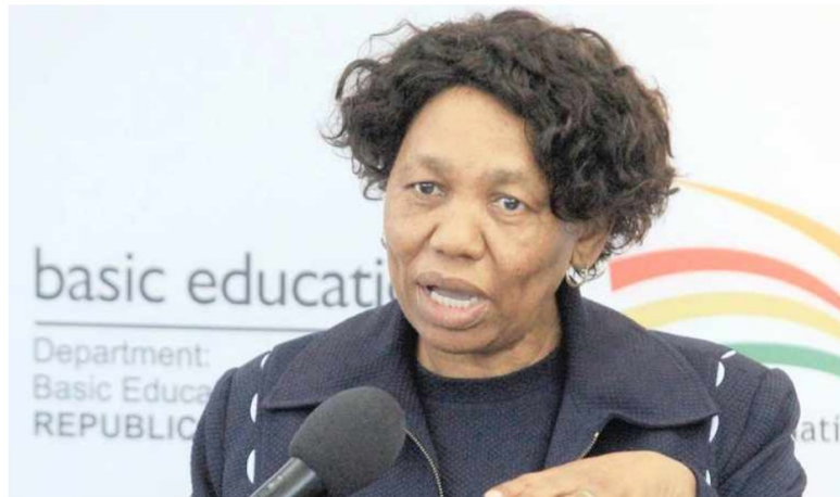
Minister of Basic Education Angie Motshekga.