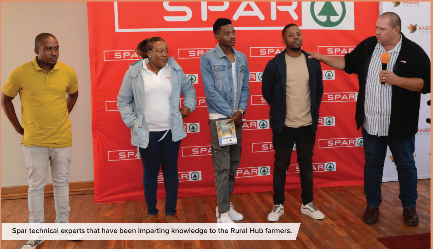
Spar technical experts that have been imparting knowledge to the Rural Hub farmers.