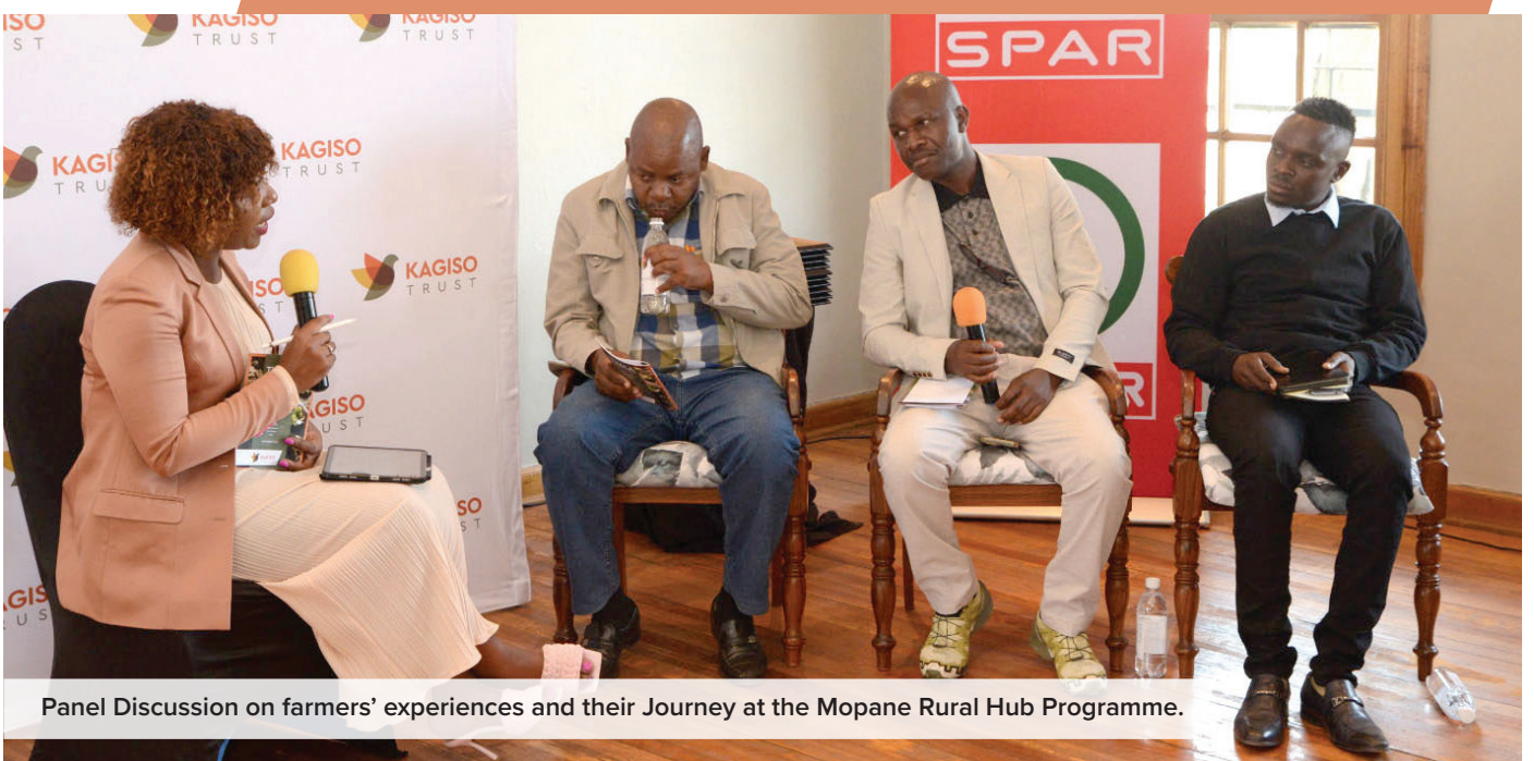
Panel Discussion on farmers' experiences and their Journey at the Mopane Rural Hub Programme.

The 2023/24 planting season marked a significant milestone in the programme, yielding the most profitable harvest to date. A total of 11 farmers participating in the programme, achieving combined gross earnings of R8.6 million, demonstrating the viability of the Farmer Aggregator Model developed by Kagiso Trust in collaboration with Spar. This success showcases the potential for scaling the model to other areas and further strengthening the agricultural ecosystem in Limpopo.