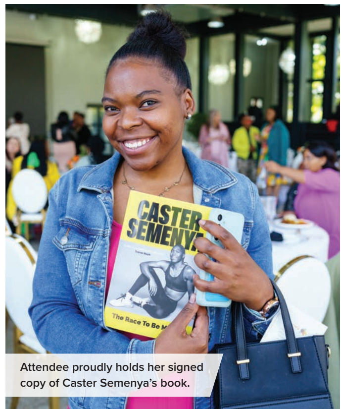
Attendee proudly holds her signed copy of Caster Semenya's book.