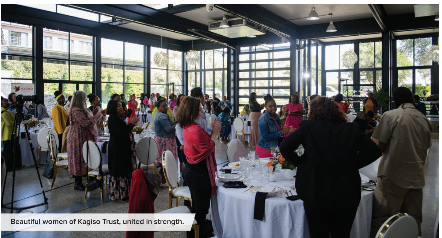
Beautiful women of Kagiso Trust, united in strength.

A highlight of the conference was the keynote address by celebrated athlete and human rights activist Caster Semenya. Semenya spoke about the many challenges she