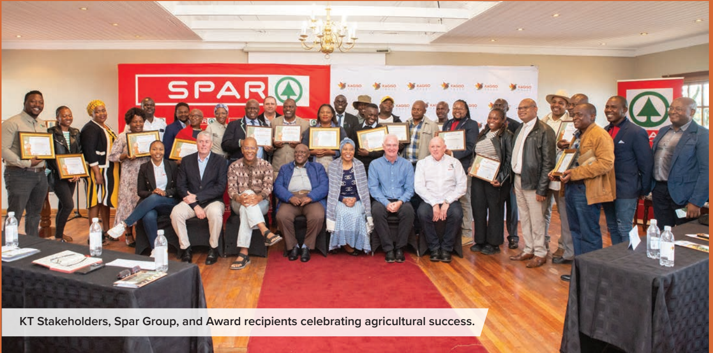
KT Stakeholders, Spar Group, and Award recipients celebrating agricultural success.