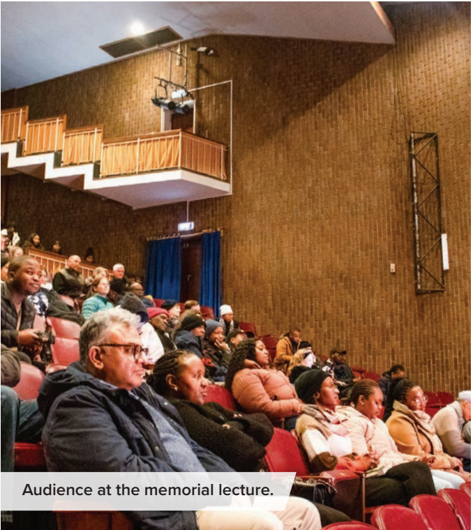
Audience at the memorial lecture.

to avoid widespread turmoil thanks to the collective action of communities, which demonstrated remarkable solidarity. He also highlighted the strength of South Africa’s democratic institutions and praised the unity of communities in addressing significant challenges. His address emphasised that, despite considerable hurdles, the active engagement of South Africans and strong democratic frameworks remain essential for ongoing nation-building.