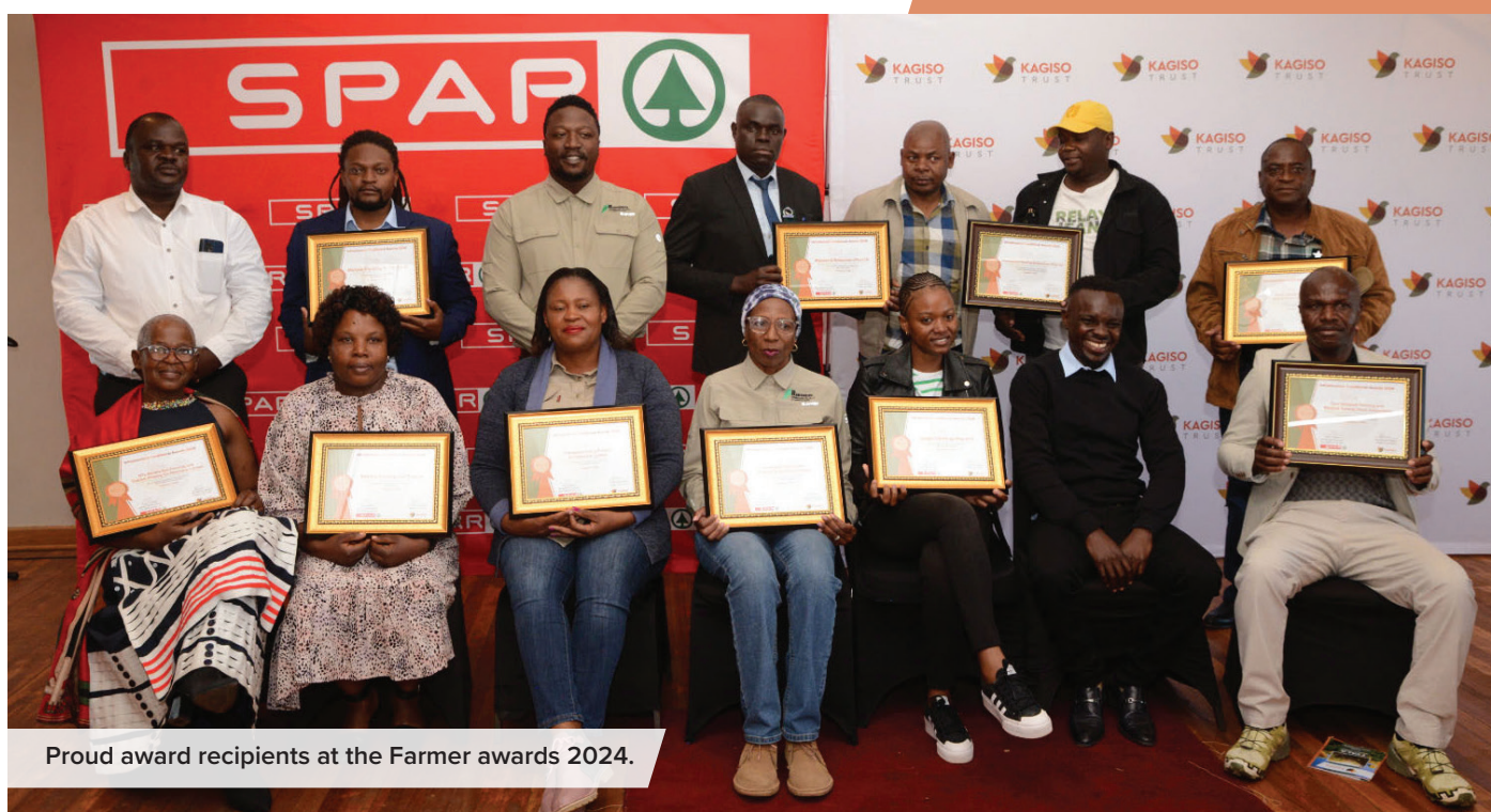
Proud award recipients at the Farmer awards 2024.