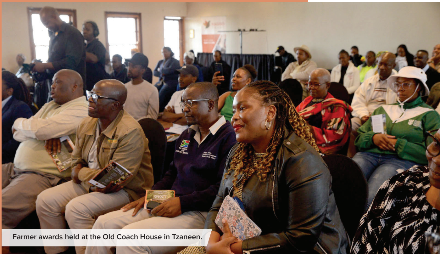
Farmer awards held at the Old Coach House in Tzaneen.