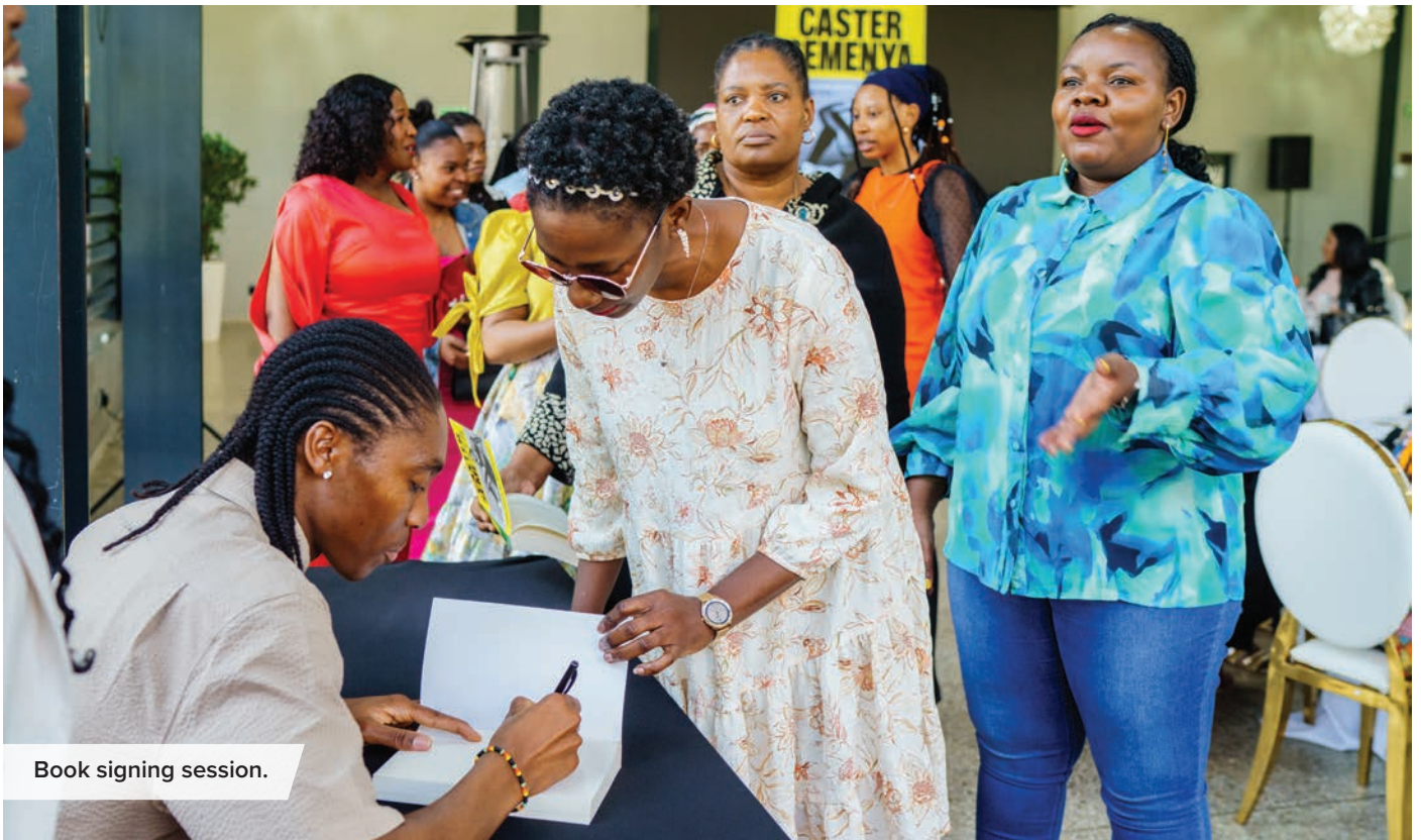
Book signing session.