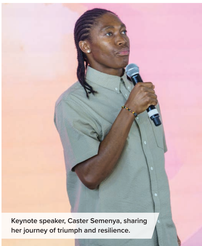
Keynote speaker, Caster Semenya, sharing her journey of triumph and resilience.

The Kagiso Trust Women’s Day Conference 2024 was not just an event; it was a celebration of strength, unity, and the power of women’s voices. By embracing the